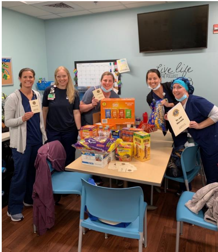
Staff at the New Hanover Regional Medical Center Medical Intensive Care looking over snacks provided by the Wilmington Lions Club