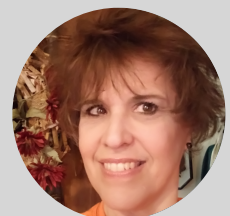
2nd Vice Dist. Governor