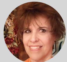
2nd Vice Dist. Governor