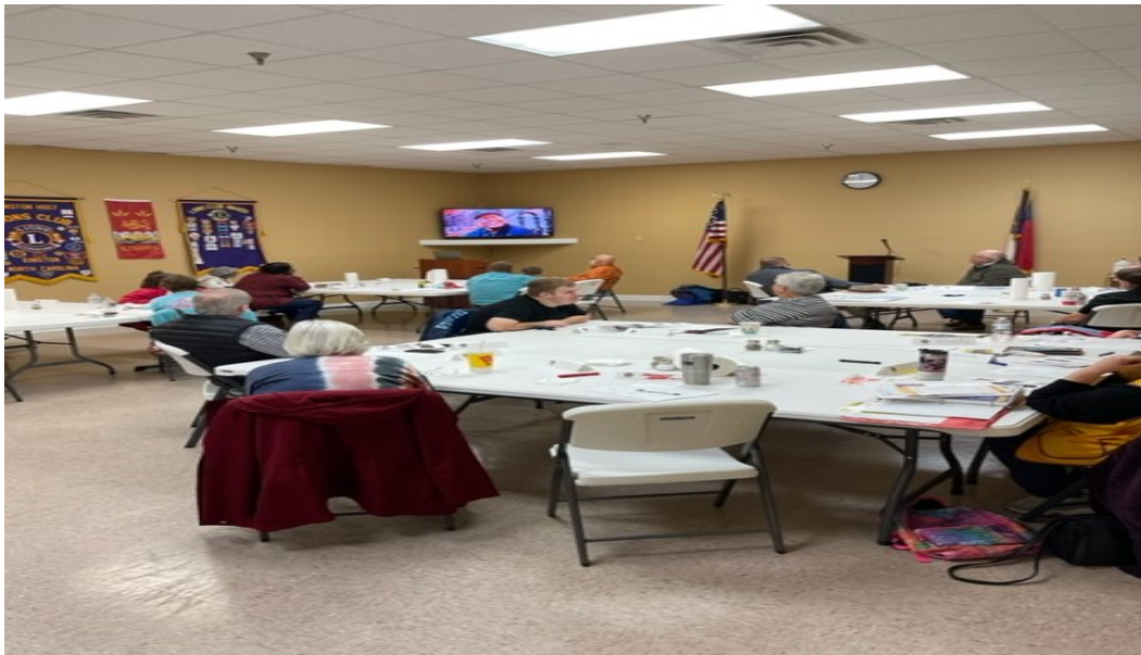
Membership Training at Lions Industries Of The Blind Inc, Kinston. February 5