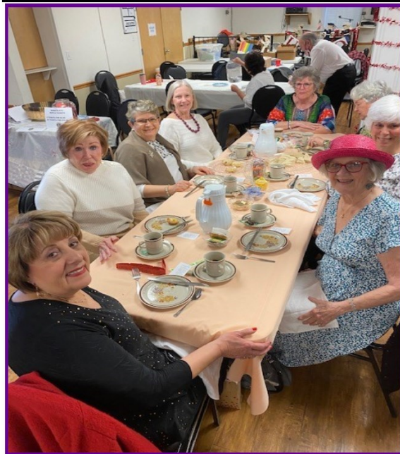
Many ladies, and a few men, enjoyed the food, tea and camaraderie at our 17th annual English Tea on February 19th at the Calabash VFW Post.