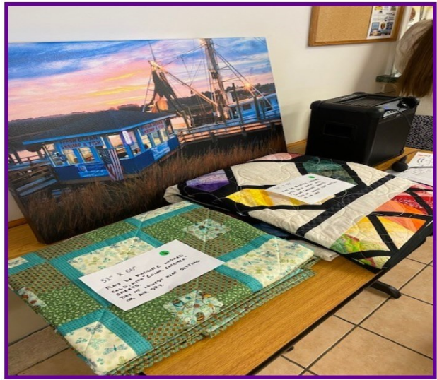
At our very successful English Tea on 02/19/22, special items were donated for a Silent Auction, which included a photo of the Calabash River and 2 handmade quilts.