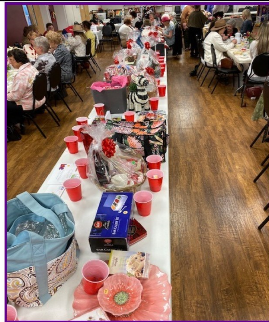
Many great prizes were donated for our English Tea Raffle Tables. The Club made a good profit, while the Guests made bids on what they wanted.