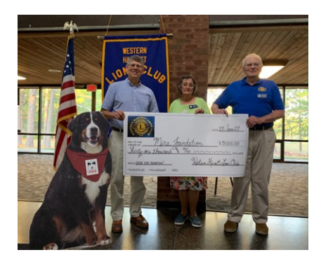
Presenting $31K to MIRA Foundation