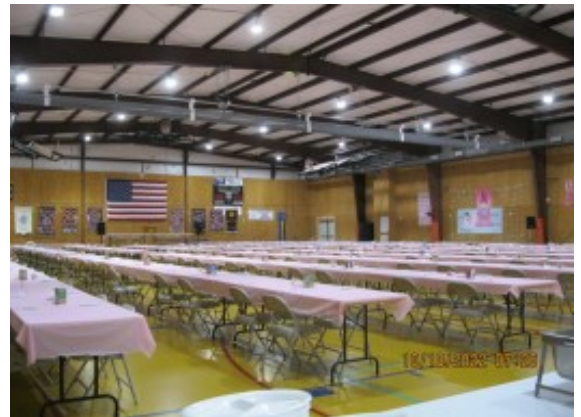
Tables are set and ready for the over 300 VIPs and their family member(s) or other assistant, to be served