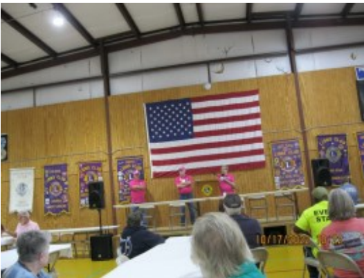
Volunteers receive instructions and job assignments before the VIP Fishing Tournament 10/16- 10/20/22, on the Outer Banks

One person may look at all that needs to be done in this world and feel overwhelmed. But when you are a Lion, you are never just one person. You have a whole team of Lions behind you!