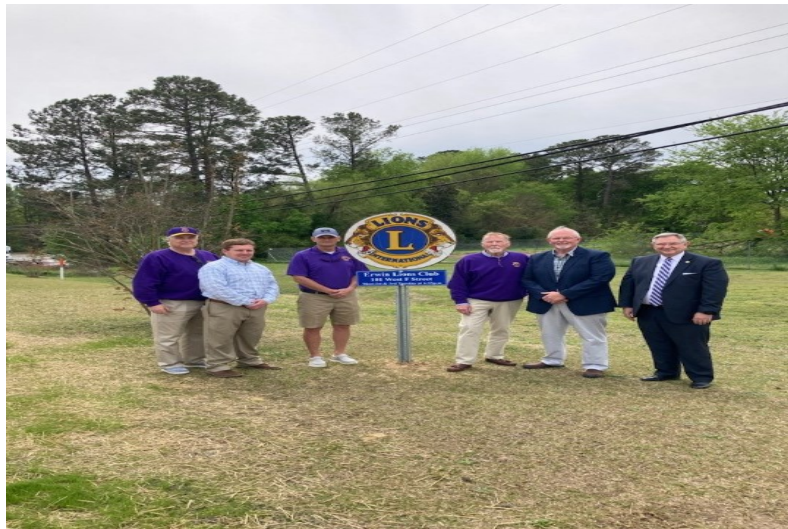
Pictured left to right...