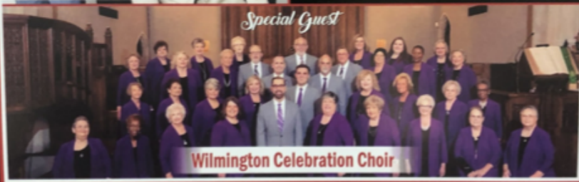
Wilmington Celebration Choir