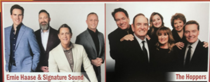
Ernie Haase & Signature Sound